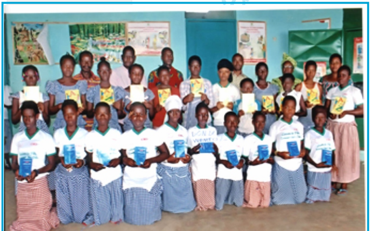
WANEP-Togo Peace Club with copies of the education guide

2.2.3. WANEP-Togo also held sessions with 71 parents of the peace club members from April 12 to 15 2016 on the rights and duties of the child: the parents' responsibility and stages of psychological development of the child. The sessions have helped to raise awareness and understanding of parents to the rights and responsibilities of the child and how best to protect these rights. The parents as a result of these sessions are able to recognize early warning signs of behavioral problems in the children.