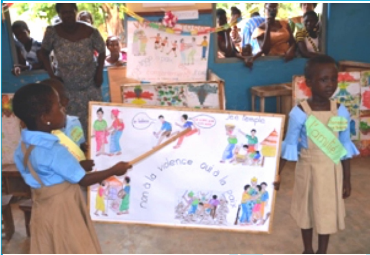
Sensitization activities facilitated by WANEP-Togo

contributed to social cohesion in families and schools.