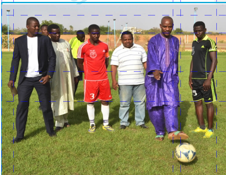
Football competition to mark the National Day of Unity. WANEP-Niger Board Chair doing the Kick off

2.3.2. UNMIL Draw Down: WANEP-Liberia in collaboration with the Federation of Liberian Youth (FLY) and the Traditional Communicators of Liberia held series of activities from June 25 to July 2 in celebration of peace and development in Liberia through the sustained efforts of the United Nations