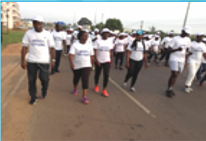
WANEP-GB celebrating International Day against Drugs.

▪ WANEP – Guinea Bissau held training sessions for fathers of peace club mediators in three schools and also celebrated the international day against drugs with funding from OSIWA. After the training, the