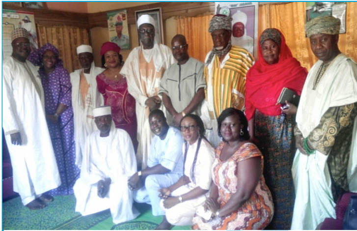
WANEP team with the Seriki Hausawa Jos North LGA

collaborative problem solving processes. It also provided the platform for evaluating the current and