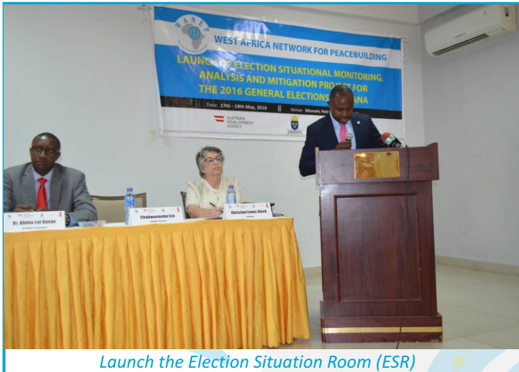
Launch the Election Situation Room (ESR)

Worried by the evolving political scenario in Ghana with regards to the 2016 general elections, the West Africa Network for Peacebuilding (WANEP) held a two-day consultative meeting at the Mensvic Hotel, Accra-Ghana on May 17 and 18, 2016, themed: “Election Situational Monitoring, Analysis and Mitigation Project: Platform for Mitigating Electoral Violence in the 2016 General Elections in Ghana.” The meeting held under the Election monitoring, analysis and mitigation (EMAM) project to discuss modalities for the operationalization of a National Election Situation Room (ESR) in preparation for the Ghana 2016 elections. The EMAM project was launched during this meeting by Honorable Prosper Bani, Ghana's Minister for Interior.