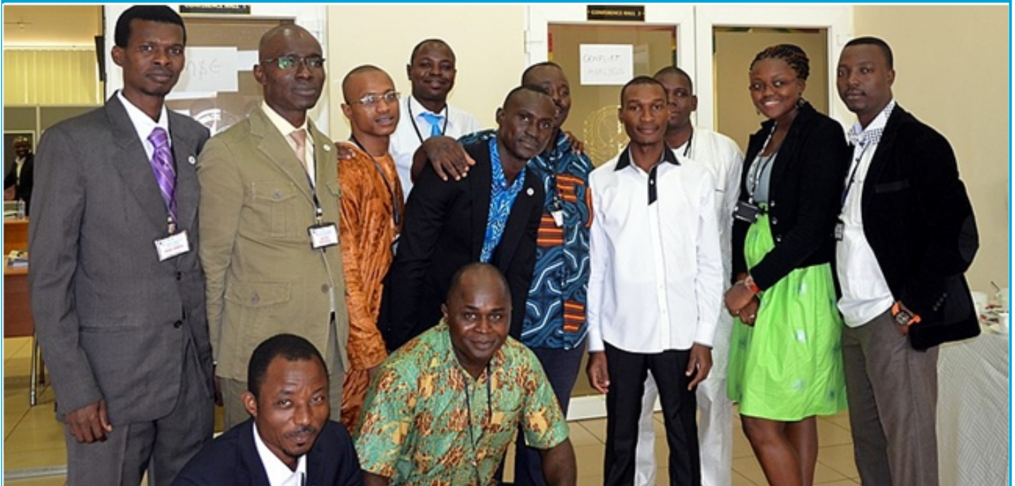
Group photograph of WANEP National Networks Staff who were participants at WAPI

courses are held on a regular basis for staff across the region towards the actualization of the organization's