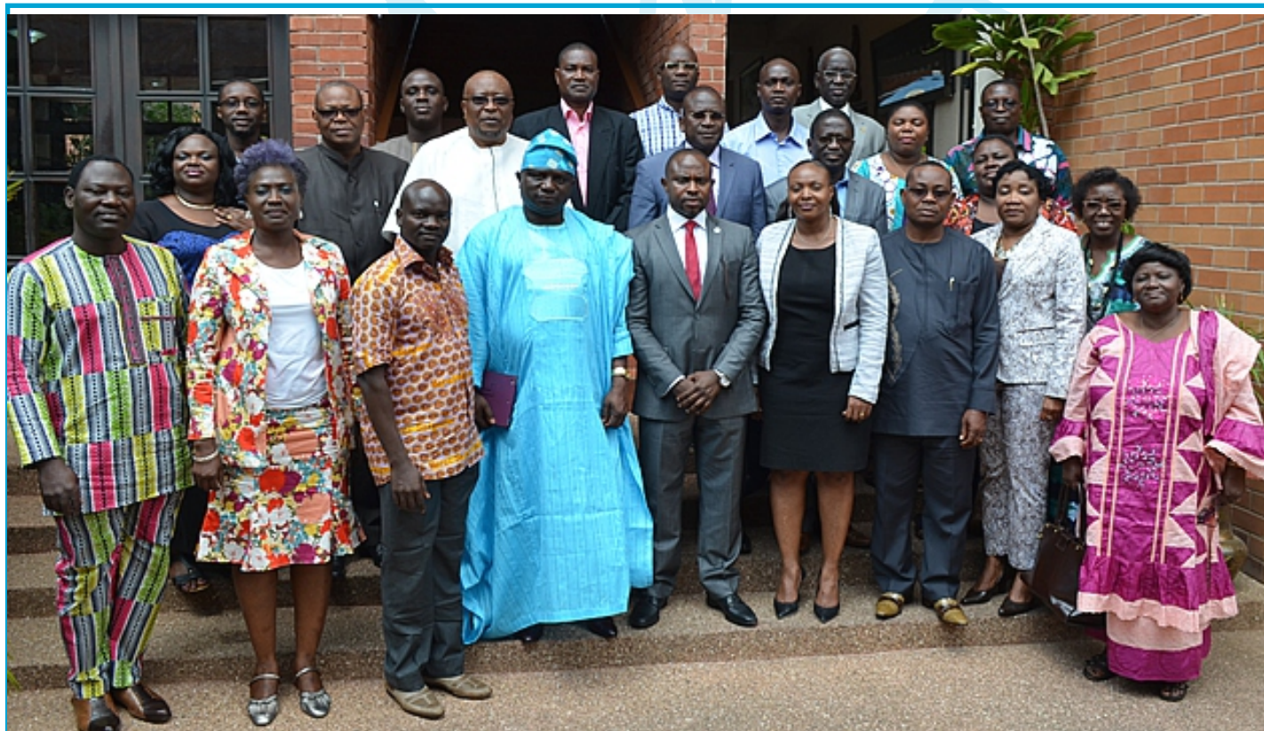
A Group Photo - WANEP Regional Management, Regional Board and the National Boards across the National Networks @ Inaugural Board Retreat

WANEP is a leading Regional Peacebuilding organization founded in 1998 in response to civil wars that plagued West Africa in the late 1980s. We place special focus on collaborative approach, working alongside major actors, particularly governments, intergovernmental bodies and women in a bid to establish a platform for dialogue, experience sharing and learning, thereby complementing efforts at ensuring sustainable peace and development.