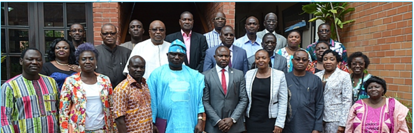
WANEP Regional Management, Regional Board and the National Boards across the National Networks @ Inaugural Board Retreat

WANEP held its first Board Retreat under the theme: “Strengthening the WANEP Governance Architecture” at the Coconut Groove Regency Hotel, Accra, from August 12 to 13, 2015. The inaugural Board retreat brought together WANEP Regional Management, Regional Board and the National Boards across the National Networks to deliberate and