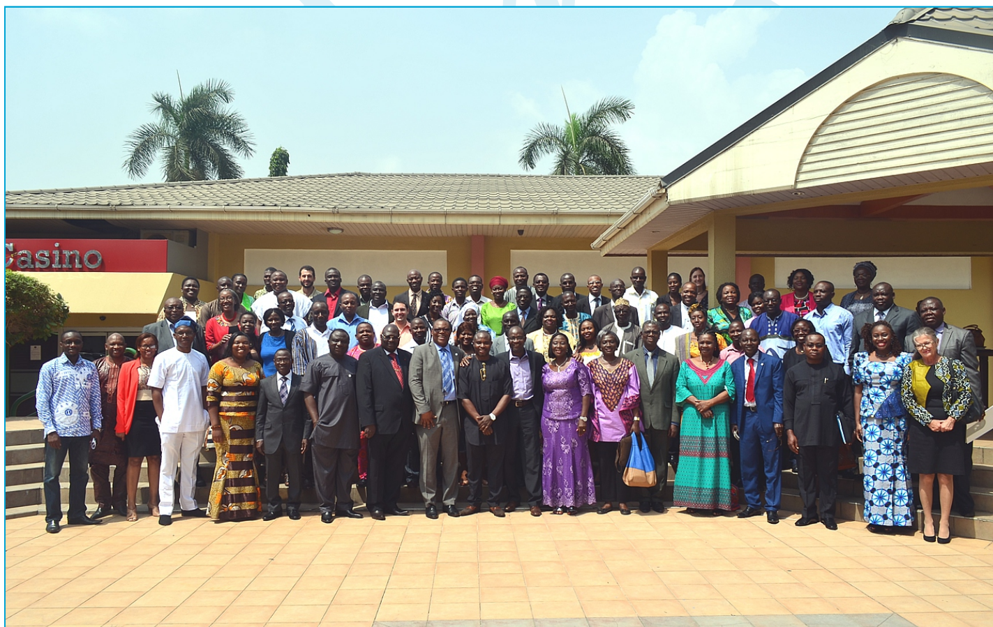
A Group Photo at the 13th General Assembly held in Accra from January 20 to 22, 2015

WANEP is a leading Regional Peacebuilding organization founded in 1998 in response to civil wars that plagued West Africa in the late 1980s. We place special focus on collaborative approach, working alongside major actors, particularly governments, intergovernmental bodies and women in a bid to establish a platform for dialogue, experience sharing and learning, thereby complementing efforts at ensuring sustainable peace and development.