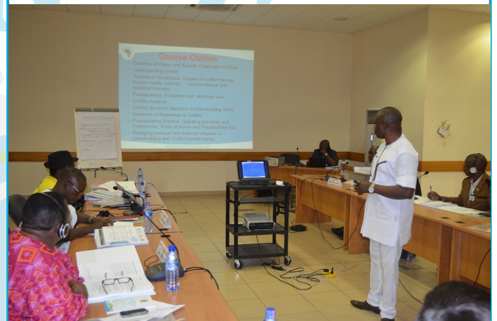
WAPI in session

relevant actors from West Africa and beyond through its wide range of courses. It provides a platform for the cross fertilization of ideas across the globe, in support of a paradigm shift in managing regional conflicts through local capacities, bearing on collective responsibility.