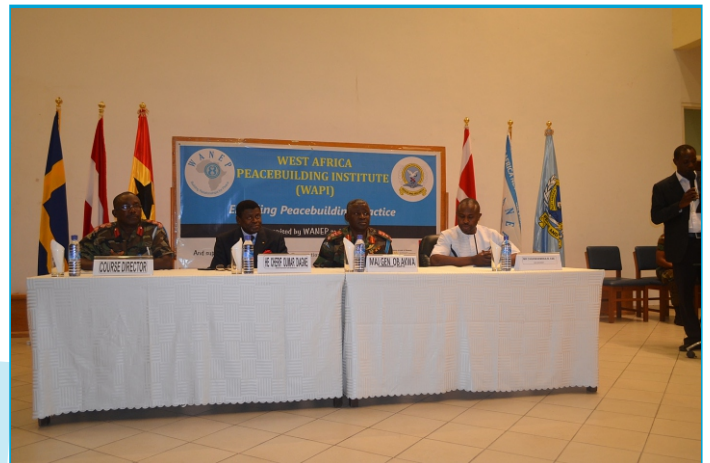
Opening Ceremony of WAPI 2015

In partnership with the Kofi Annan International Peacekeeping Training Centre (KAIPTC), WANEP held the 13th session of the West Africa Peacebuilding Institute, WAPI from March 2nd to 26th, 2015 with 46 participants (22 females and 24 males) across Africa including the ECOWAS Commission and the African Union. WAPI is designed to provide specialized, intensive, and culturally sensitive training in conflict transformation and peacebuilding to Civil Society Organizations (CSOs), and