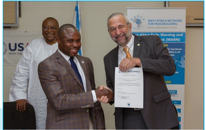
WANEP Executive Director & USAID West Africa Mission Director

WANEP and the United States Agency for International Development, USAID entered into a unique partnership on February 23, 2015 with the signing of a five-year contract for the implementation of a project on electoral violence. The direct partnership between the two institutions is the first of its kind in the region and attracted high-level interest from the US government including Counsellor to the US State