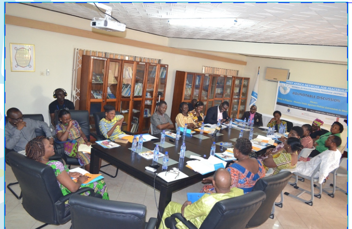
Participants during the Roundtable Discussion held at WANEP regional office, Accra-Ghana

Worried by the growing threat of terrorism and violent extremism in West Africa and its grave impact on women, WANEP held a roundtable discussion to