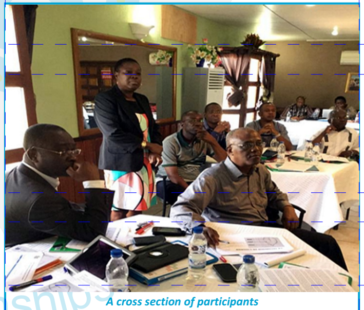
A cross section of participants

The Independent Electoral Commission of Cote d'Ivoire formally solicited WANEP to train its staff on election dispute management in the quarter under review. The training was held on March 25 – 27, 2015 at Grand Bassam with a total of 20 EMB staff including the four Vice Presidents and all the Central