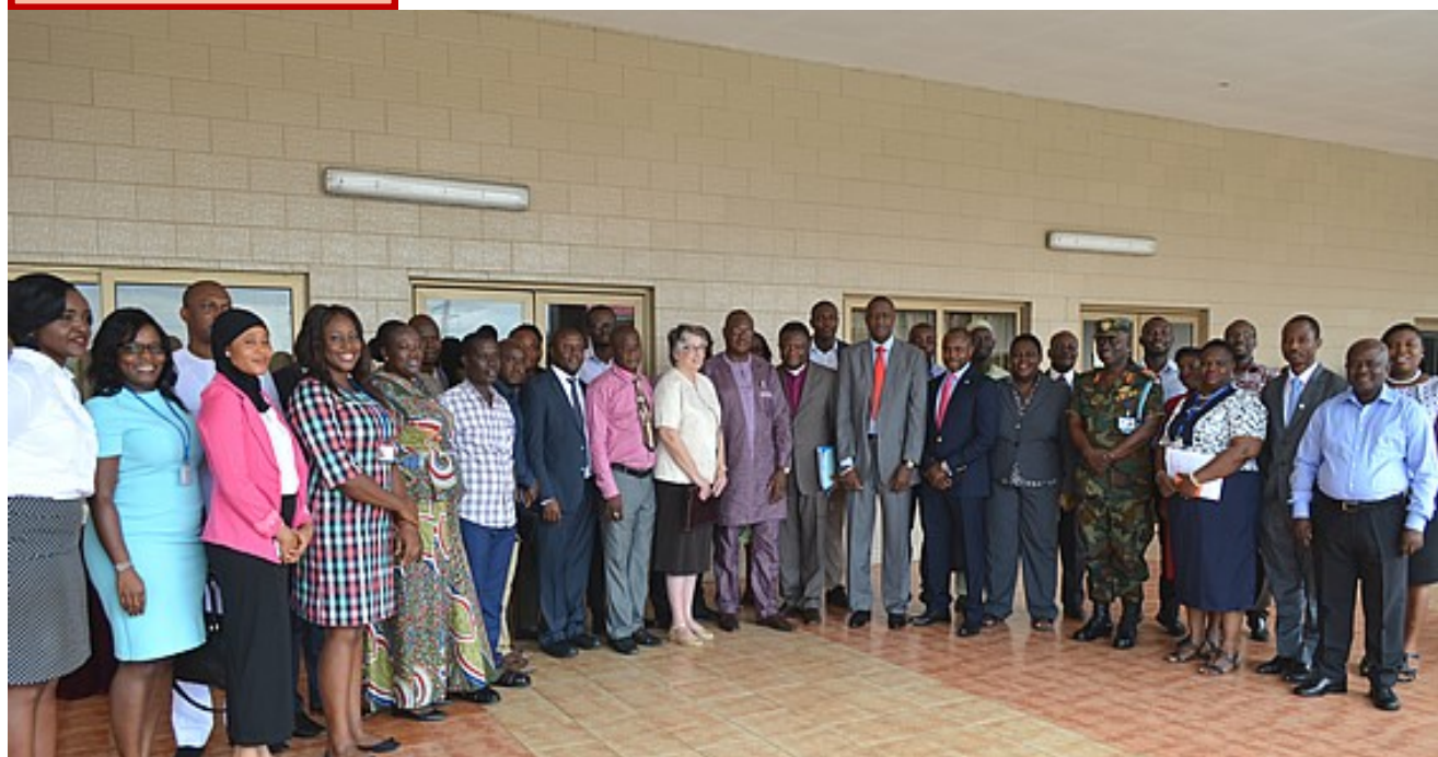
Key stakeholders and major partners with WANEP staff at the launch of the Election Situational Monitoring, Analysis and Mitigation (EMAM) Project