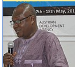
Hon Prosper Bani , Ghana Minister for Interior