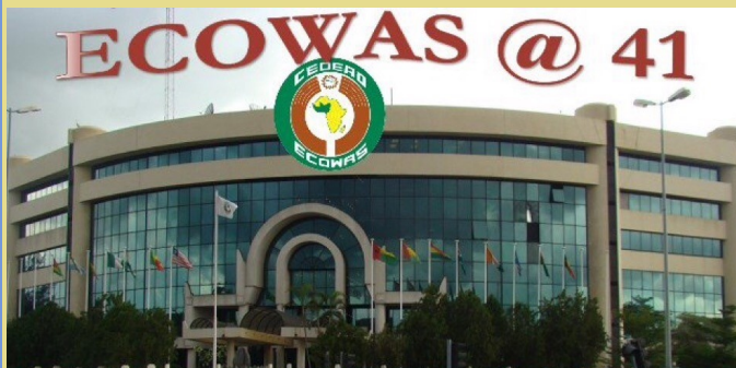
Moving from an ECOWAS of State to an ECOWAS of people