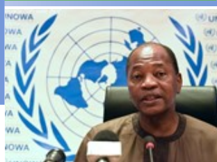
Dr Ibn Chamas , Special Representative to UNOWAS

More from the link: http://www.wanep.org/wanep/index.php?option=com_content&view=article&news-releases&Itemid=8