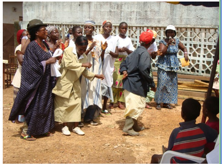
Women in Danané doing a drama sketch on violence against women during a sensitization activity. Below; peace hut coordinator (2nd left) with other women in front of one of the peace huts

Apart from sensitization activities, WANEP-CI also facilitated the establishment of a peace hut in the three communities and trained a pool of women to coordinate the activities under the huts. The experiences of the Liberia Women Peace Huts were harnessed through cross sharing which allowed for a good replication of the concept taking into consideration the context and immensely contributing to the success of the peace huts. The women are determined to continue the fight for their rights. Through the peace huts, women have been empowered to report to the police or gendamerie issues bothering on violation of their rights and gradually, they are gaining grounds in deconstructing this systemic violation of rights in different forms. With the increased awareness about their